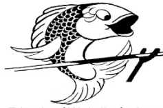
Friends of Wakulla Springs